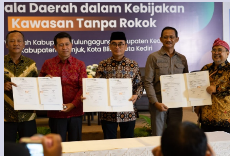
Mayor of Kediri, Blitar, and Tulungagung cities signed a Smoke-free Commitment