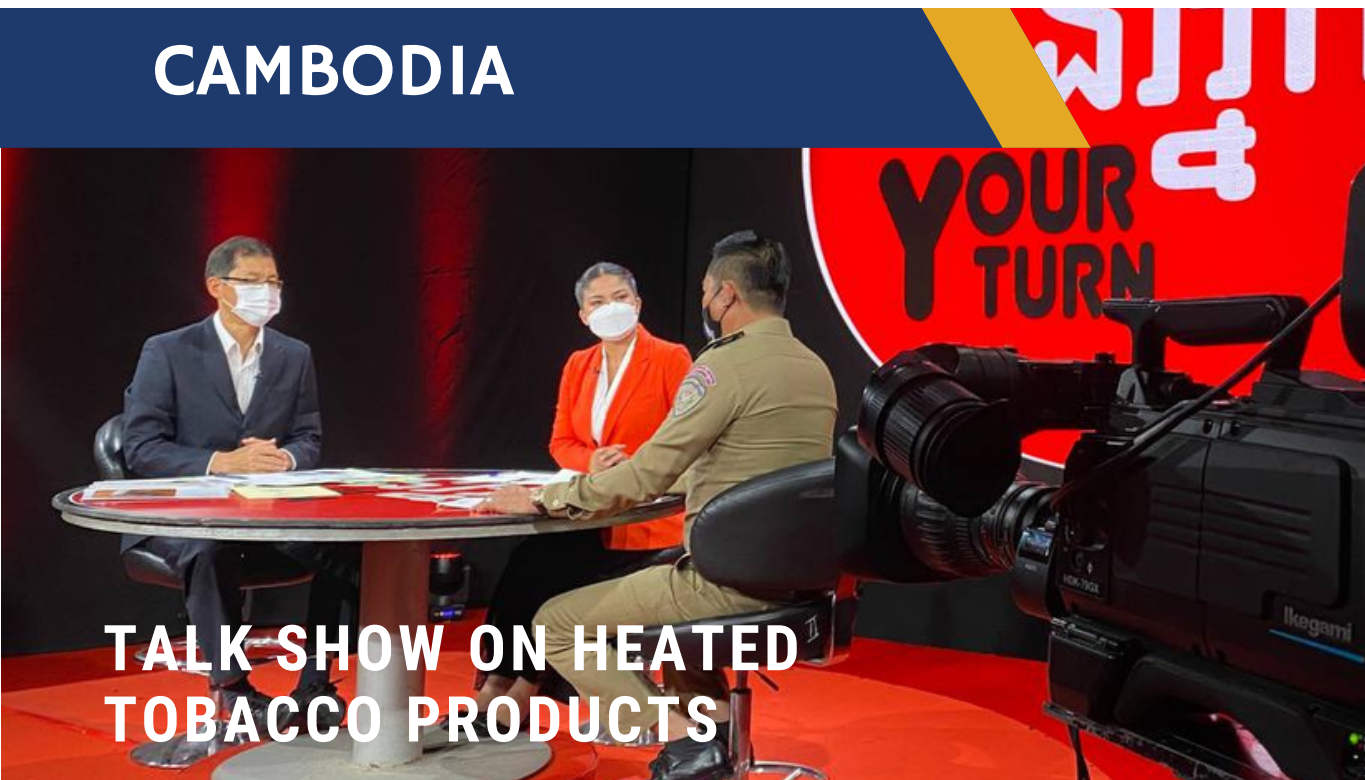
Deputy Director of NCHP, MOH Cambodia in Talk Show

The Union provides technical and grant support to the National Centre for Health Promotion (NCHP) at the Ministry of Health (MOH) Cambodia. The support includes effectively implementing the WHO MPOWER strategy and prohibition of e-cigarettes and heated-tobacco-products (HTPs).