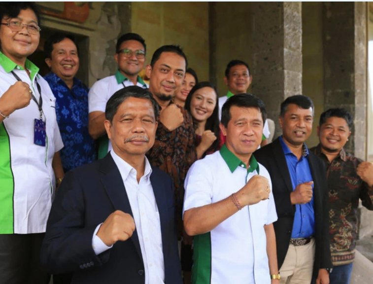
Meeting with Mayor I Nyuman Suwirta, Klungkung district, Bali

Throughout July, The Union met with 10 district and city mayors and other key stakeholders to discuss the implementation of smoke-free, ban tobacco advertising, tobacco control enforcement, and much more. Alongside local grantees, The Union met with: