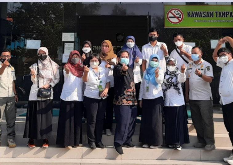
Working with the Smoke-free team in Kulon Progo

For more detail about the meetings, read the full article on The Union website.