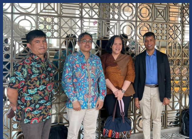
Meeting with National TB Program Manager

The Union met with the National TB Program (NTP) Manager Indonesia to discuss scaling up smoking cessation in tuberculosis (TB) control, as well as The Union's role in TB monitoring, capacity building and operational research.