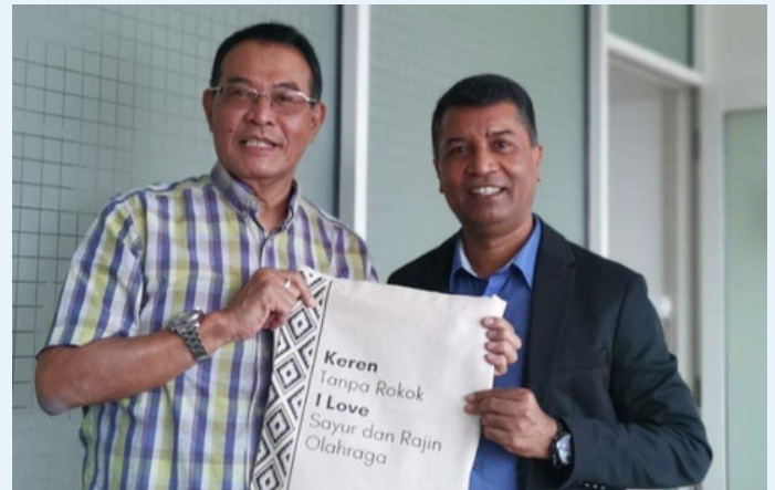
Meeting with Chair of AKINKES

ADINKES will initiate the drafting of a joint ministerial decree and index on subnational tobacco control. They will also advocate for the integration of smoking cessation within TB control programs.