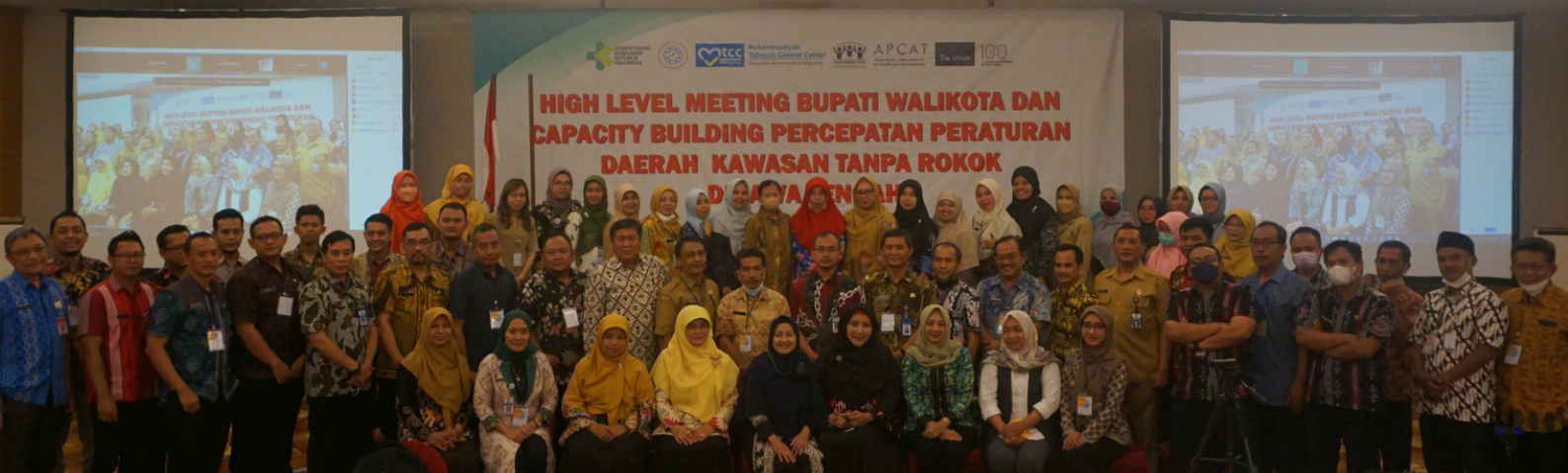
Capacity Building workshop on smoke-free environments and tobacco advertising, promotion and sponsorship ban