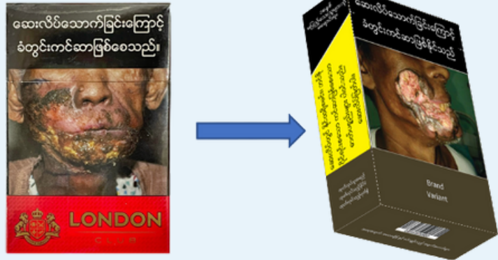
Current Tobacco Products Vs. Plain Packaging of Tobacco Products in Myanmar