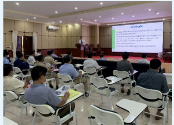
Sub-Committee Meeting on Tobacco Products Control on Preventing the Use of E-Cigarettes, Heated Tobacco Products, and Shisha