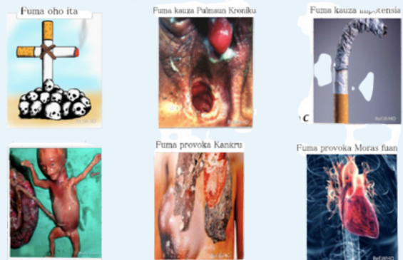
Fig 18: Current PHWs in Timor-Leste

..... For more information, please contact