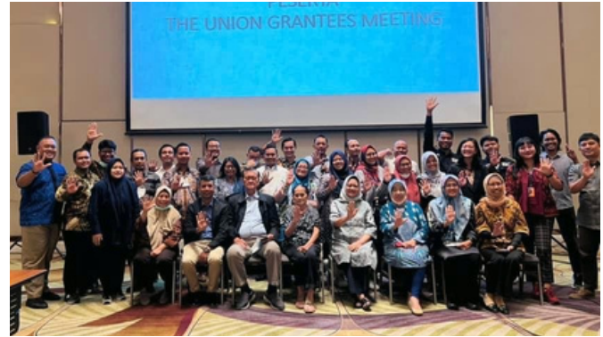
2022 The Union Grantees Meeting