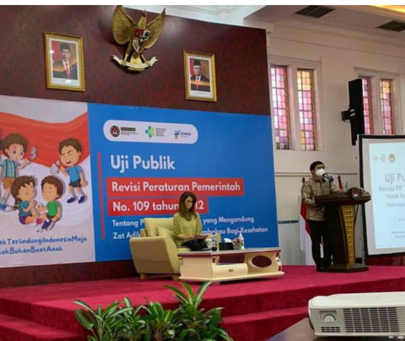
Vice-Minister of Health presenting the evidence-based information